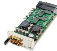
UTC010 Power Module