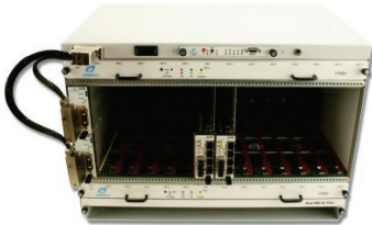
VT893 MTCA Chassis