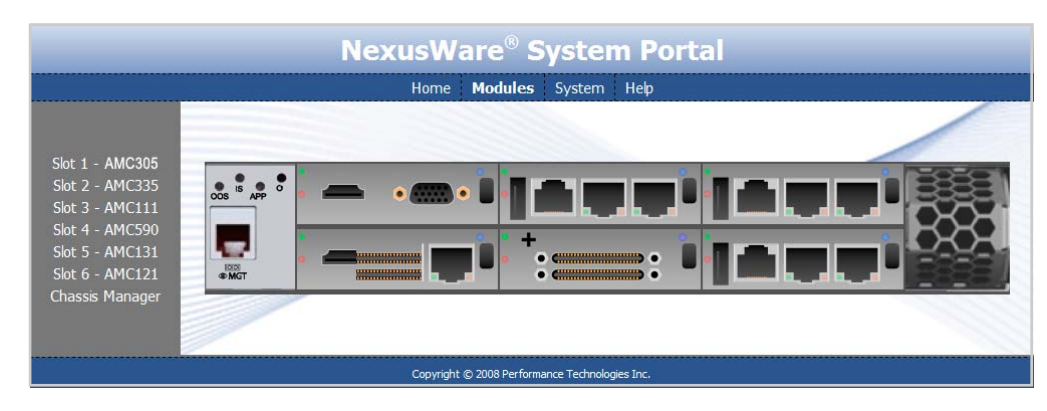
GUI Screen Shot of MTC507X

NexusWare<sup>®</sup> Portal is a web-based management and development tool in NexusWare Core used to remotely manage, monitor, and maintain the current configuration of each Advanced MC^{TM} module within a Performance Technologies' MicroTCA<sup>TM</sup> platform as well as monitoring the functionality and operations of the MicroTCA platform itself.