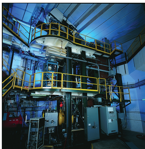
8 S800 Spectrograph