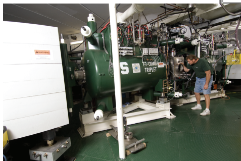
4 A1900 Fragment Separator